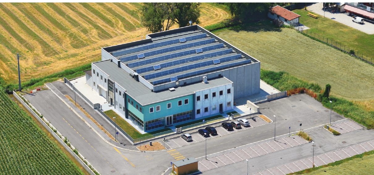
The headquarters: over 1,500 sq.m. of factory located at Trissino (VI), where today about twelve specialized technicians are employed